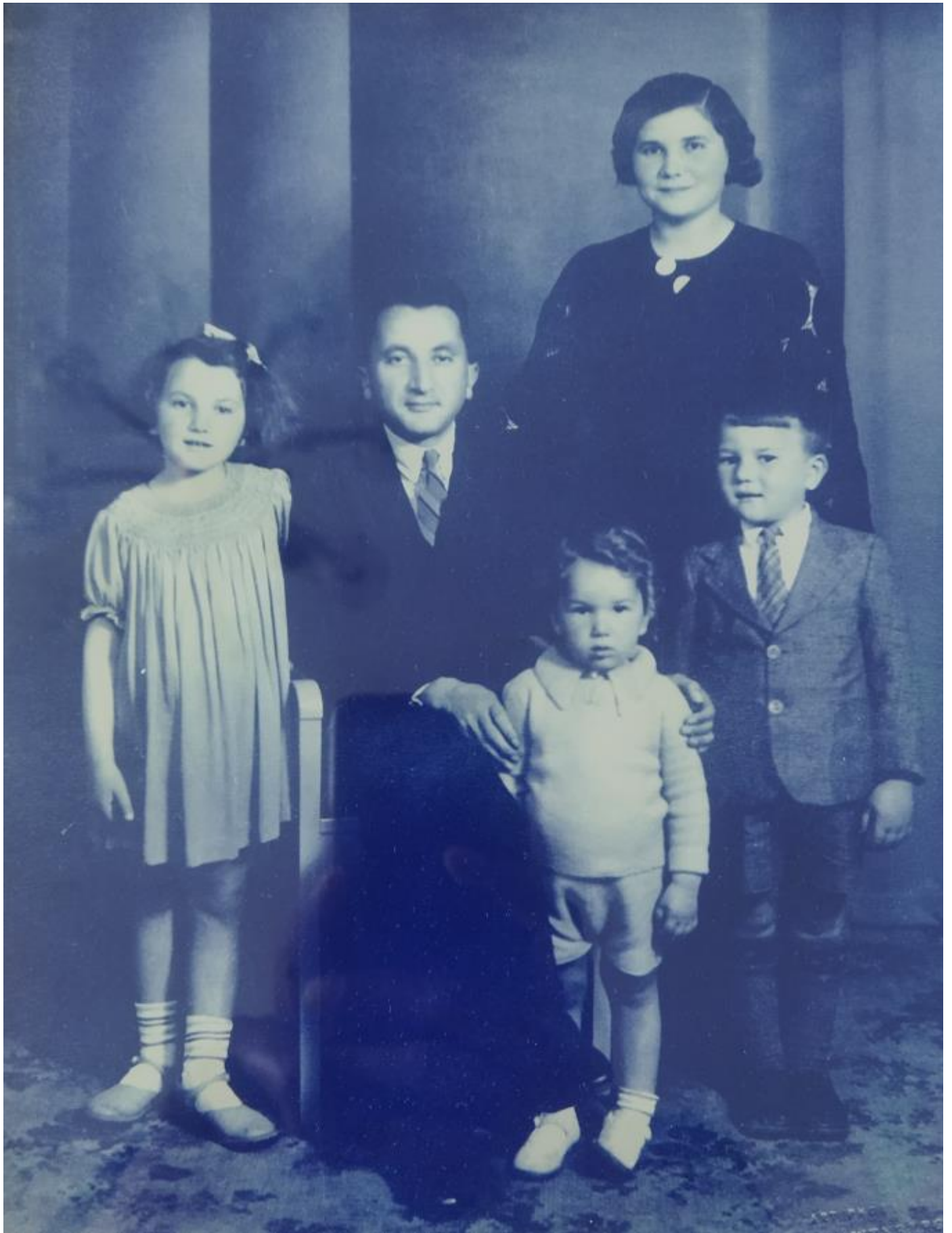
The Buchinsky Story