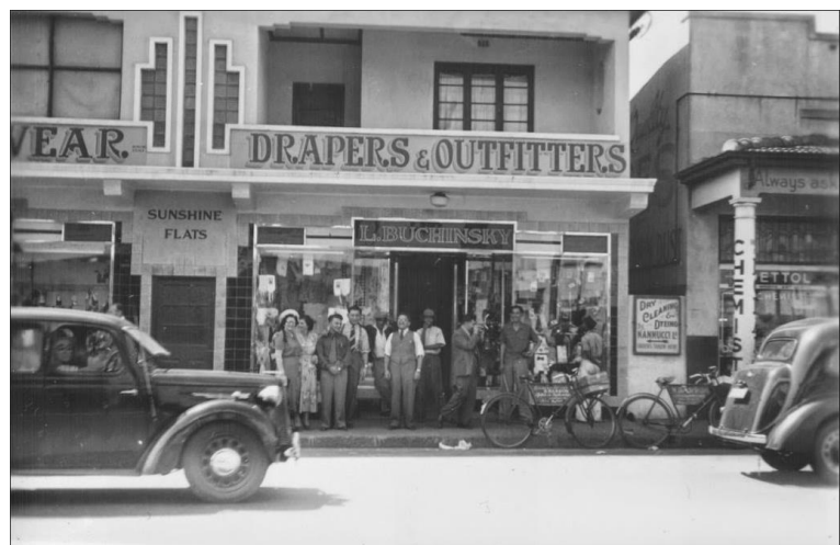
Our shop on Voortrekker Road.