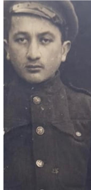
Ca. early 1920s

After some weeks, or maybe months, he realized that if he did not break out he would soon just be another dead body, and so one day when they were out in the forest, on the spur of the moment he made a mad dash away from the work site. But to where? It made no difference. Either the guards didn't see him, or they were just too lazy to chase after him.